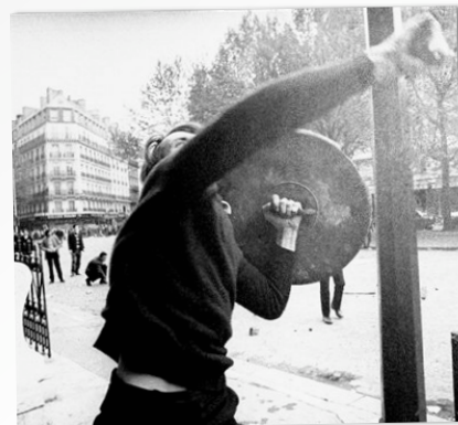
A RECENT PHOTO OF JEWEL, THROWING A RAGE http://apimages.ap.org/